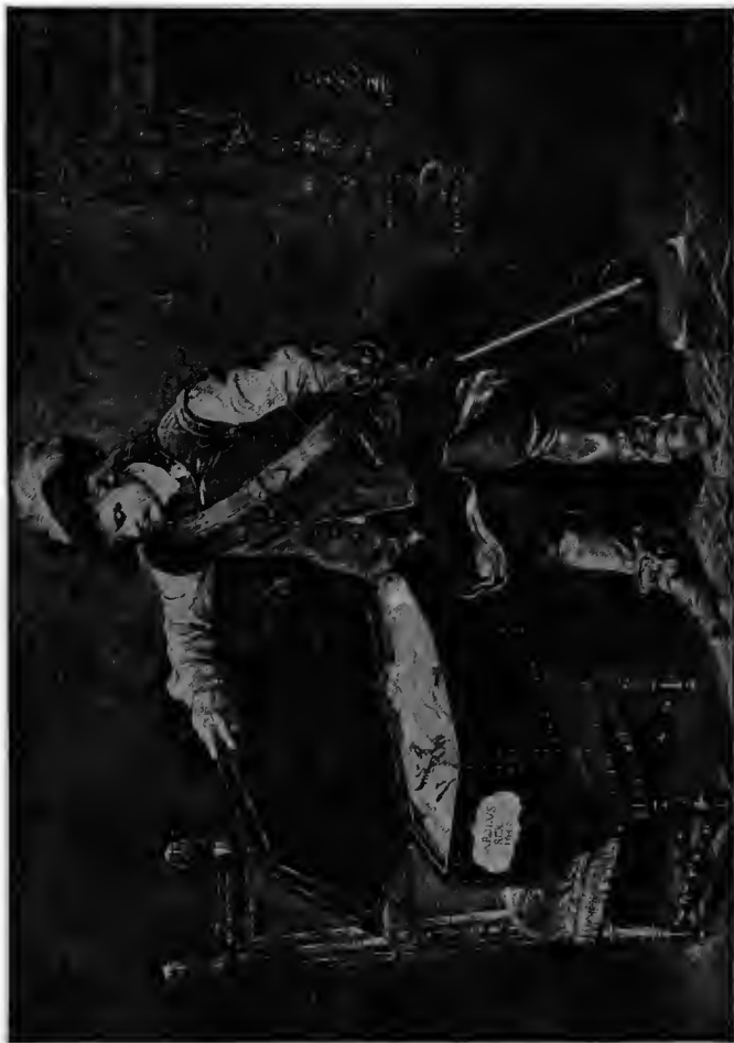
Cromwell contemplating the dead King